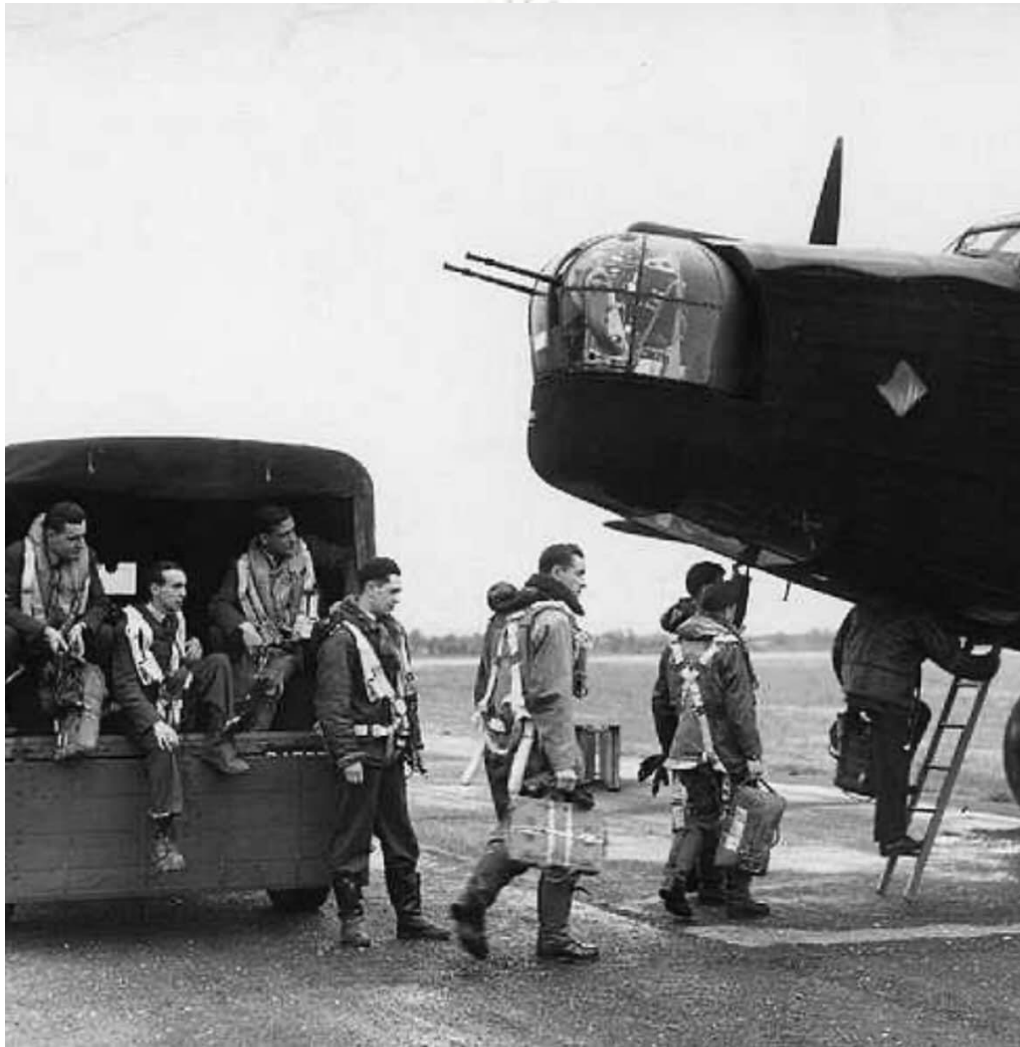
RAF Bomber Command Aircrew of No. 405 (Vancouver) Squadron RCAF board their Wellington Mk II at Pocklington, July 1941.